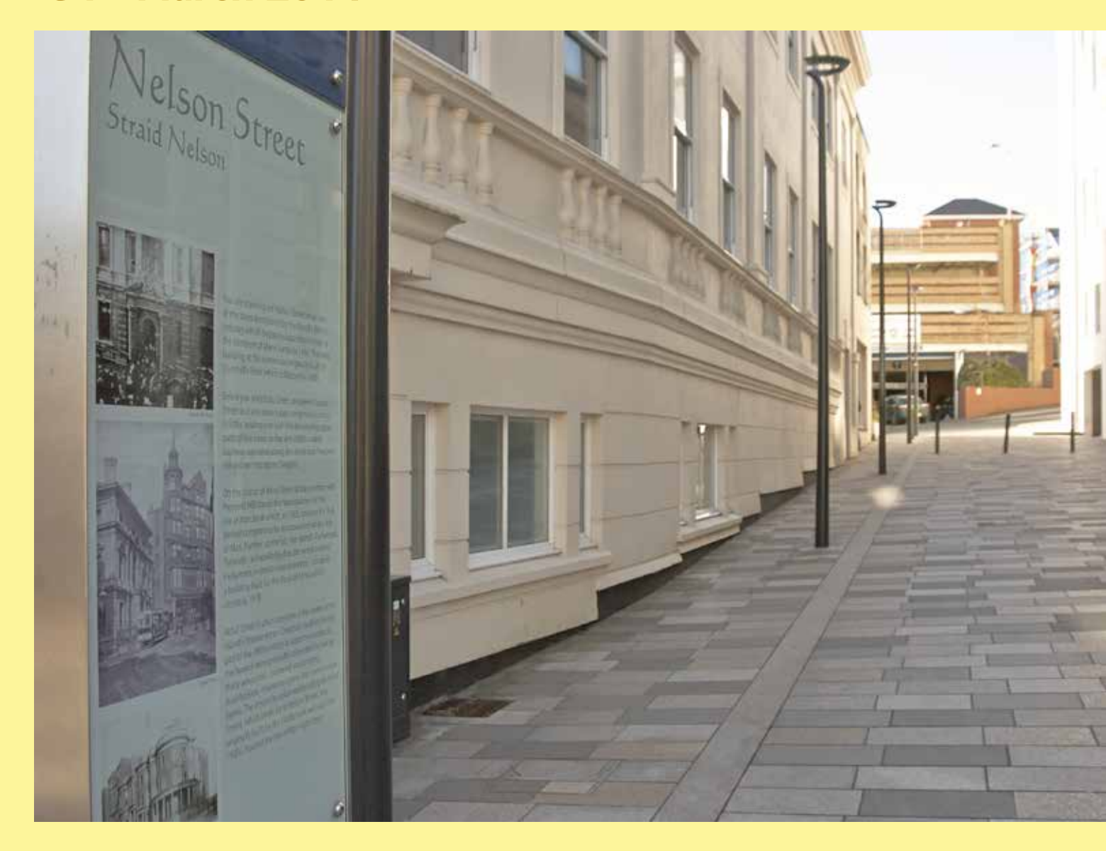
Town Centre Regeneration